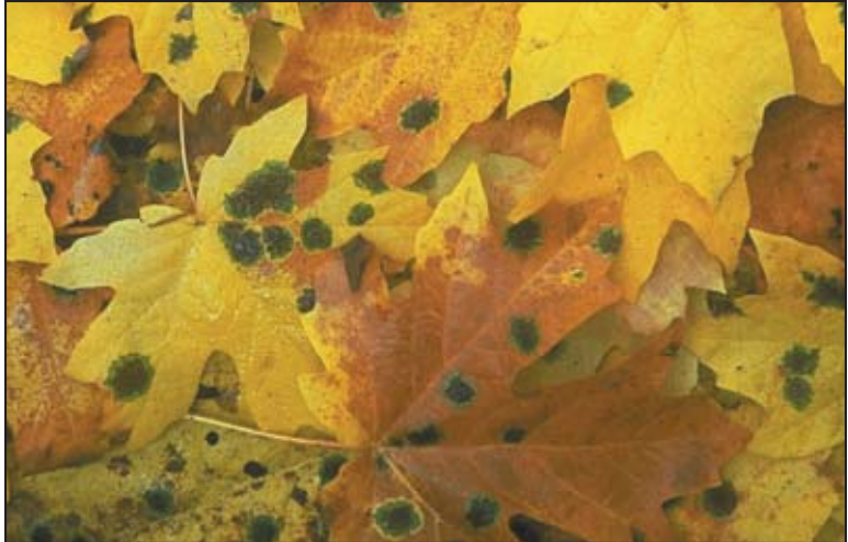
Mold growing on fallen leaves.

This document is available on the Environmental Protection Agency, Indoor Environments Division website at: www.epa.gov/iaq/molds/moldguide.html