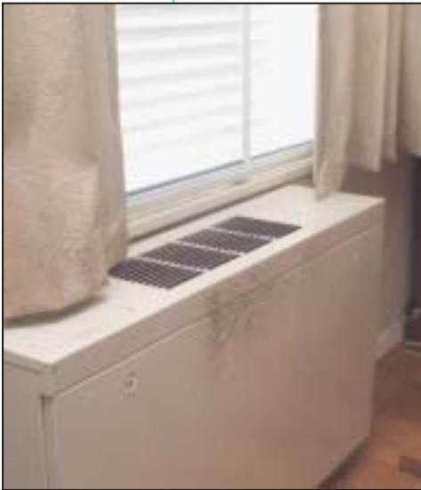
Mold growing on the surface of a unit ventilator.