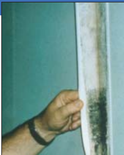
Mold growing on the back side of wallpaper.

Suspicion of hidden mold You may suspect hidden mold if a building smells moldy, but you cannot see the source, or if you know there has been water damage and residents are reporting health problems. Mold may be hidden in places such as the back side of dry wall, wallpaper, or paneling, the top side of ceiling tiles, the underside of carpets and pads, etc. Other possible locations of hidden mold include areas inside walls around pipes (with leaking or condensing pipes), the surface of walls behind furniture (where condensation forms), inside ductwork, and in roof materials above ceiling tiles (due to roof leaks or insufficient insulation).