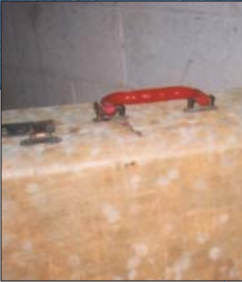
Mold growing on a suitcase stored in a humid basement.

It is important to take precautions to LIMIT YOUR EXPOSURE to mold and mold spores.