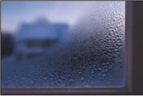
Condensation on the inside of a windowpane.