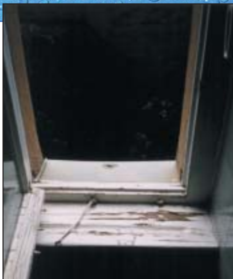
Leaky window – mold is beginning to rot the wooden frame and windowsill.

If you already have a mold problem – ACT QUICKLY.