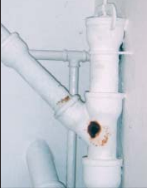
Rust is an indicator that condensation occurs on this drainpipe. The pipe should be insulated to prevent condensation.

Renters: Report all plumbing leaks and moisture problems immediately to your building owner, manager, or superintendent. In cases where persistent water problems are not addressed, you may want to contact local, state, or federal health or housing authorities.