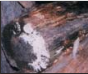
Mold growing outdoors on firewood. Molds come in many colors; both white and black molds are shown here.

Molds are part of the natural environment. Outdoors, molds play a part in nature by breaking down dead organic matter such as fallen leaves and dead trees, but indoors, mold growth should be avoided. Molds reproduce by means of tiny spores; the spores are invisible to the naked eye and float through outdoor and indoor air. Mold may begin growing indoors when mold spores land on surfaces that are wet. There are many types of mold, and none of them will grow without water or moisture.